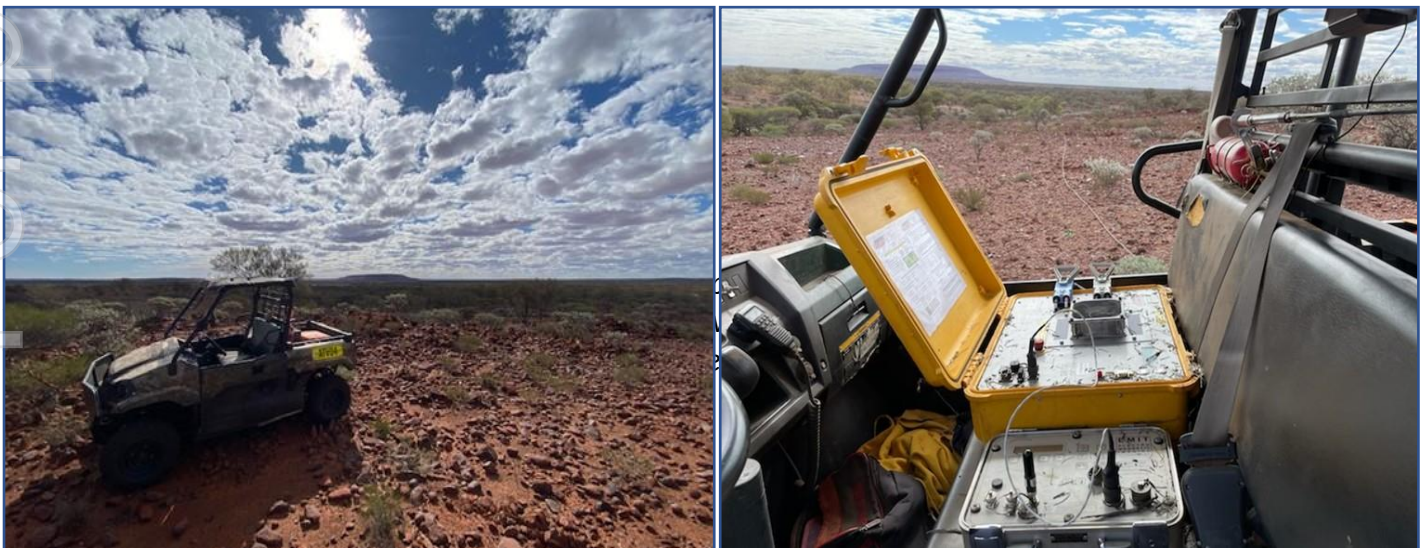
Figure 1: Wireline Services crews on site at Rixon with majestic Mt Yagahong in the background.

Peak Minerals Ltd (ASX: PUA) ( Peak or the Company ) is pleased to announce that Moving Loop Electromagnetics (MLEM) surveys have commenced at our Green Rocks Project over the Rixon, Lady Alma and Target B prospects. The surveys are a critical step before drilling Heli-EM conductors. A total of 13 lines and 22 line km of surveying is planned (4 lines at Target B and 9 lines at Rixon and Lady Alma). The surveys are expected to resolve conductors identified by the Heli-EM survey and detect new, buried targets. Results are expected by the end of May.