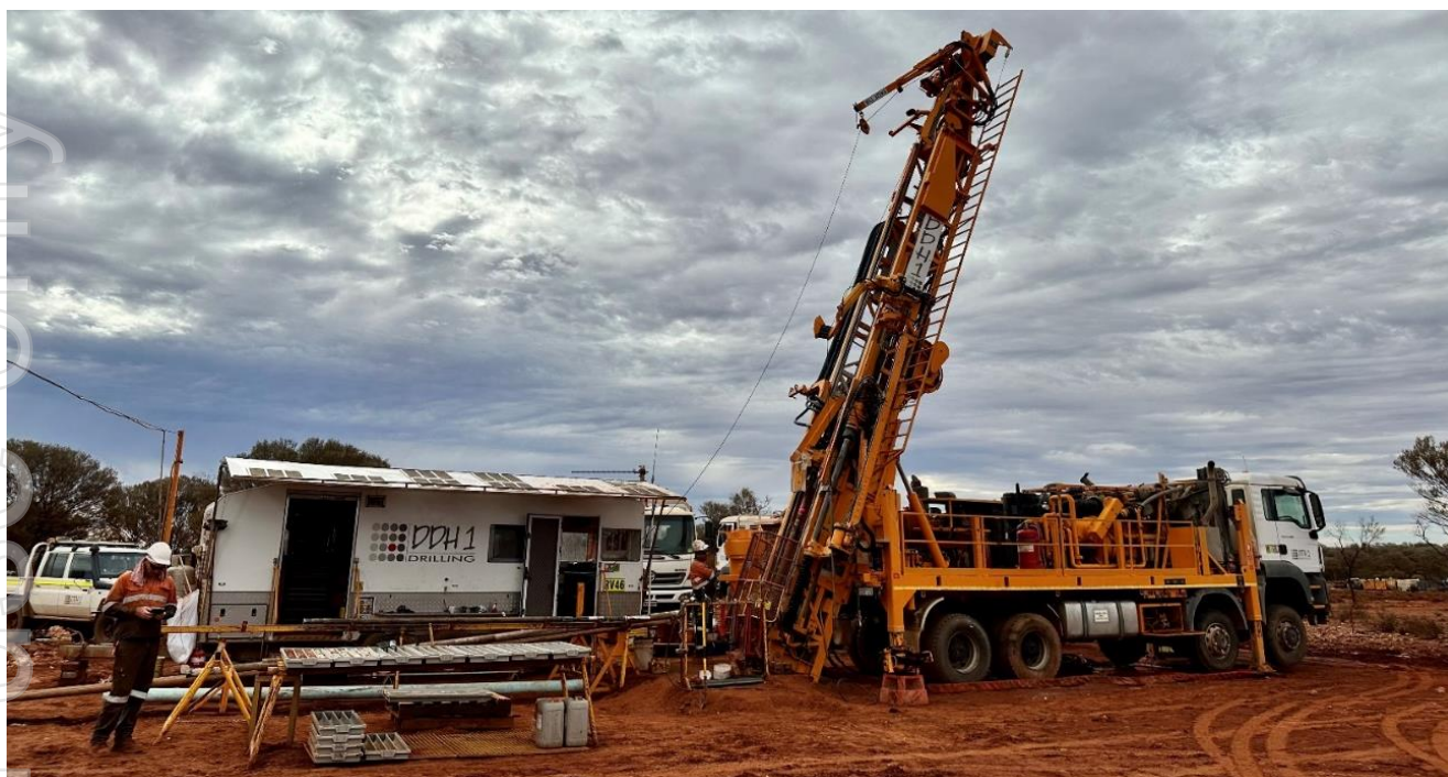
Figure 3: Convertible diamond/RC rig in the final stages of setup to commence drilling at Earraheedy.

With the drill rig on site and having successfully completed the diamond holes, the Company took the opportunity to add an RC hole to the program to follow up on the 2021 intersection of 3m of 1.57% Cu from 86m, which ended in mineralisation.