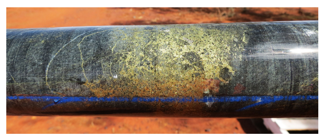
Figure 3: CHD005B-W1 from 899.1m - band of semi-massive chalcopyrite with blebs of pyrrhotite

Drill core has been logged and sent for assay - results will be released to the market on receipt.