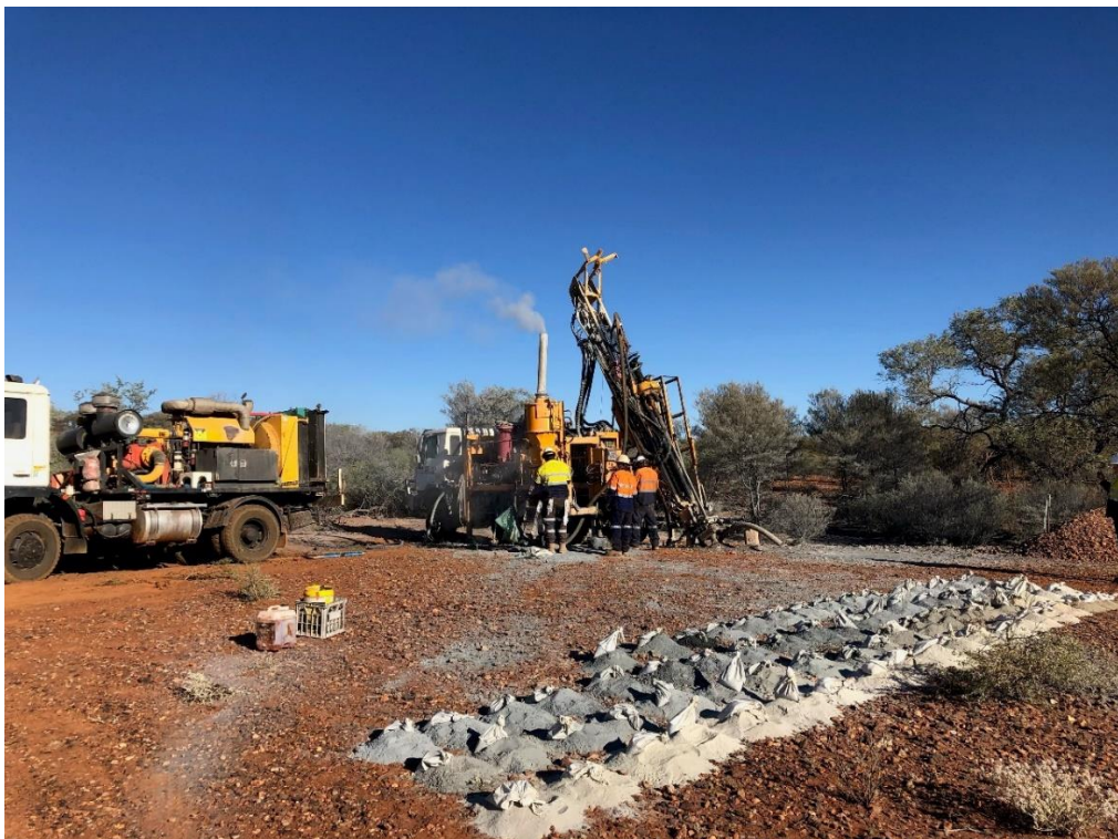
Figure 1. Impact Drilling air core rig set up and drilling the first hole at Green Rocks, testing geochemical anomalism.