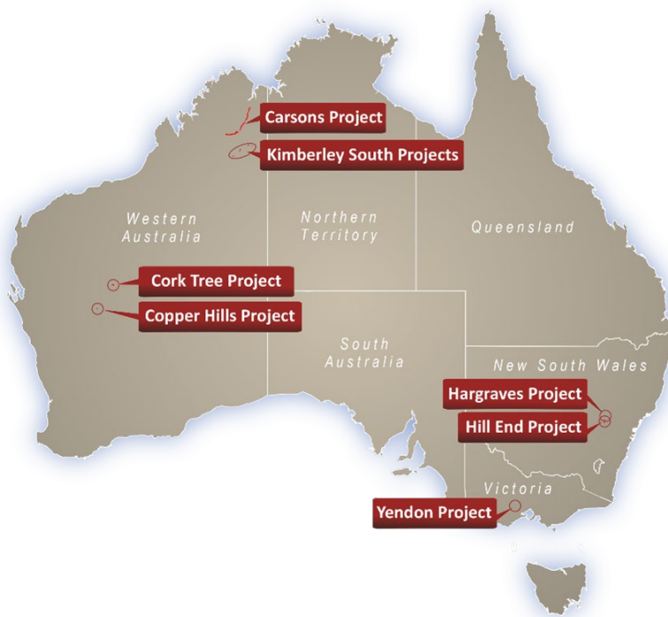
Figure 1: Overview of Peak Minerals projects

During the financial year ended 30 June 2021, the Company has entered into agreements to acquire a number of base metal exploration projects, with a strong copper focus, within Western Australia. The Company now holds a strong portfolio of greenfields assets with an exploration strategy to systematically explore these to define a new magmatic sulphide province.